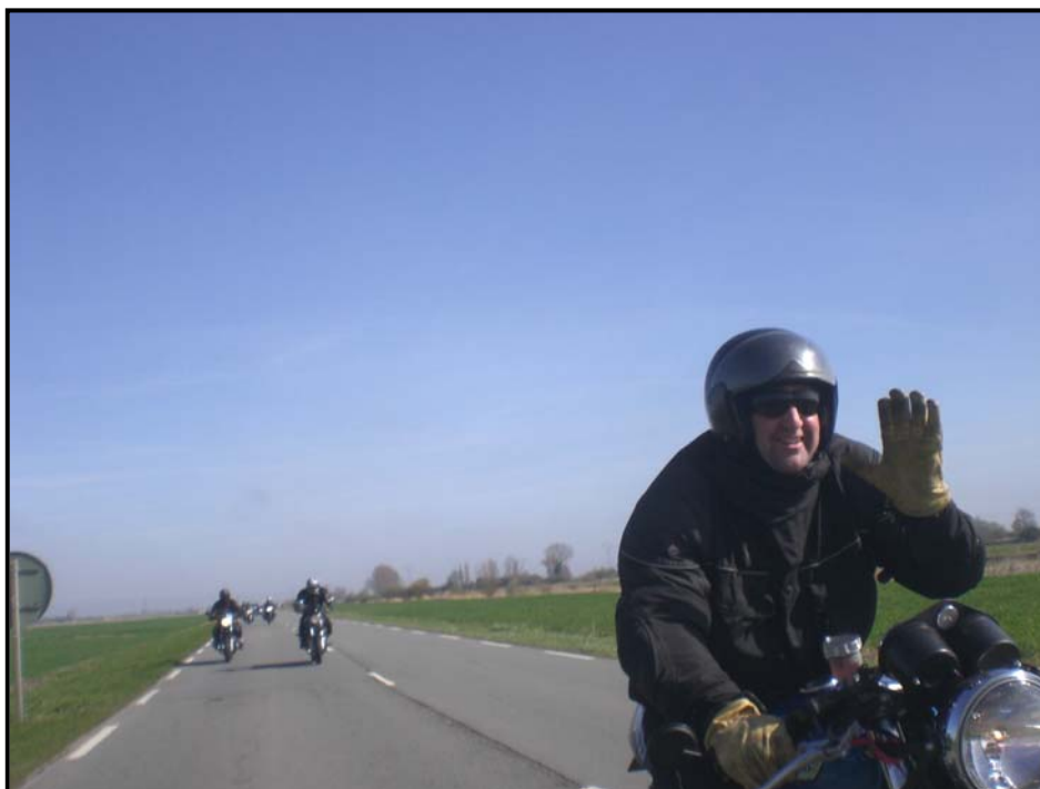
Picture taken on the Vengeance Weapons trip - April 2009